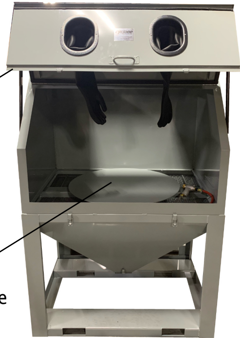
700 Pound Capacity Turn Table