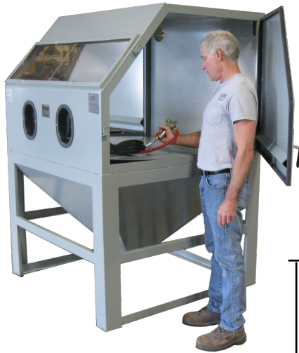
Side Door Dimensions Left & Right